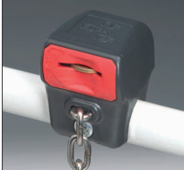
COD. 01.MDCS. SMARTLOC FOR 0,50 - 1 - 2 EURO