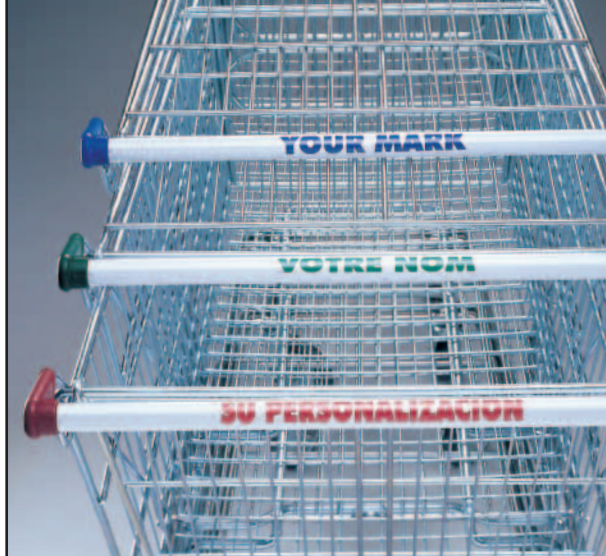
COD. 01.00.012.00 PERSONALIZED HANDLE