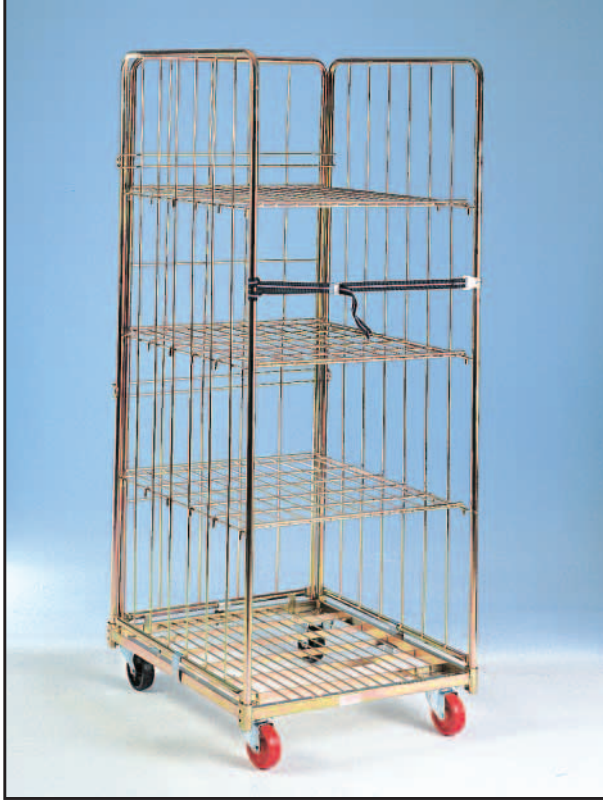
“ROLLPAK” WITH ACCESSORIES 3 rd side wall, shelves and strap.