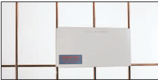
COD. 04.00.029.00 DATA PLATE mm220x110