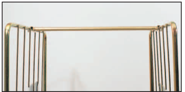
COD. 04.01.004.00 CLOTHES RAIL