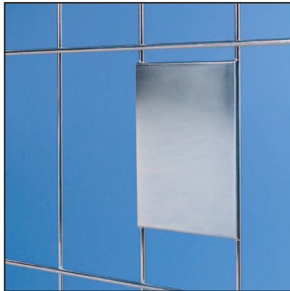
DATA PLATE Dimensions: mm160x200