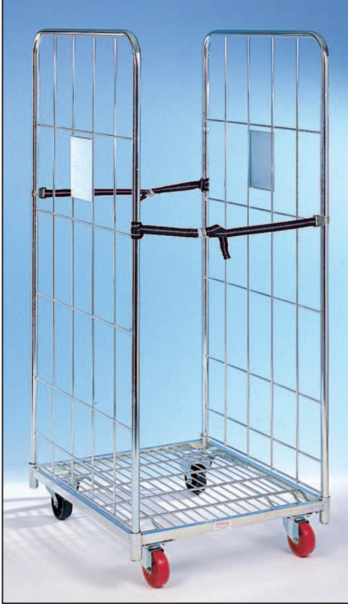
“ROLLPAK” F25 1680 with wheels \varnothing 106x40